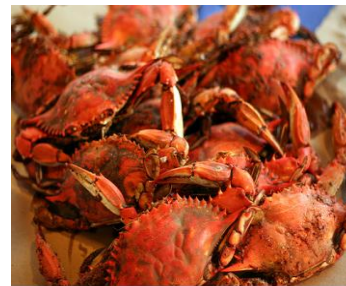
Steamed Blue Crabs

Shrimp & Grits $ 8.99 (Blackened, Fried, Grilled, Garlic)